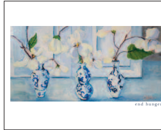
Honor and Appreciation Card