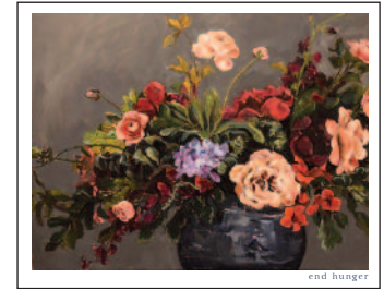
In Memoriam Card

3 Number of families to feed _____ x $5 = $ _____ ( minimum $5 per card. )